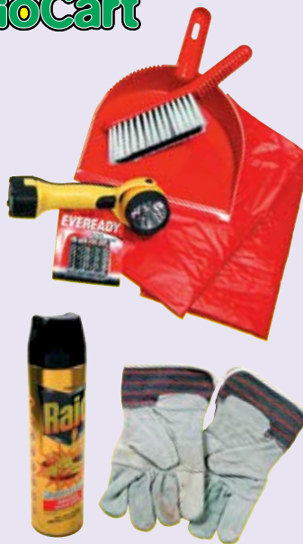
Items are conveniently stored in the upper plastic 'clip-seal' container.