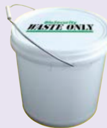
10 litre plastic pale with sealed lid, stored inside the larger 46L Bin.