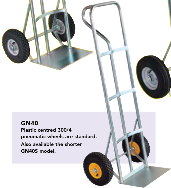
GN40 Plastic centred 300/4 pneumatic wheels are standard. Also available the shorter GN40S model.