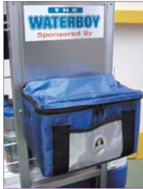
Rear Carry Bag attached, ideal for First Aid kit, team valuables.