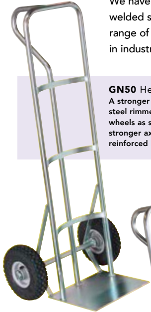
GN50 Heavy Duty A stronger gooseneck with steel rimmed, pneumatic wheels as standard, thicker, stronger axle, and a heavier, reinforced lip.

We have a Hand truck for every purpose. Constructed in high-quality welded steel with attractive zinc-plated finish, they're available with a range of wheel options – pneumatic or solid rubber. Extremely popular in industries where high usage and heavy loads are common.