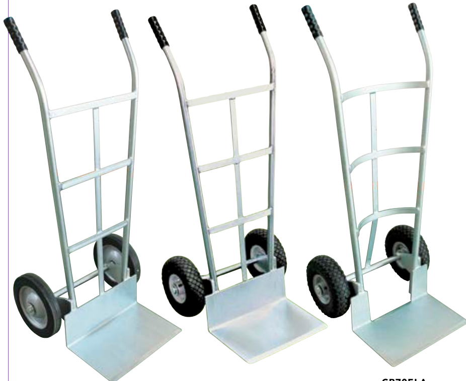
SM48EL Standard lip, solid rubber tyres.