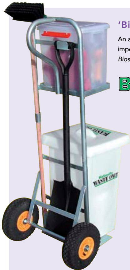
The Broom & Shovel stowed at the rear in easy reach when needed.