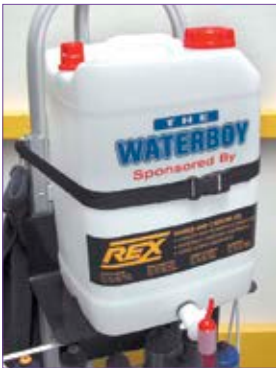
20L fluid container with tap, strapped to upper tray.

Give your team the professional look of success with this very handy drinks trolley. The trolley is based on our popular GN40 Hand-truck. Provide the team with essential sustenance, while displaying sponsors' logo and messages.