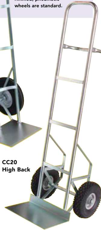
CC20 High Back