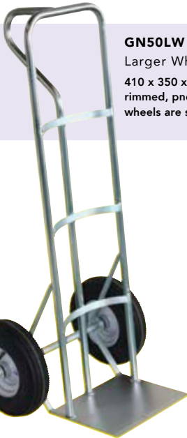
GN50LW Heavy Duty Larger Wheels 410 x 350 x 6 steel rimmed, pneumatic wheels are standard.